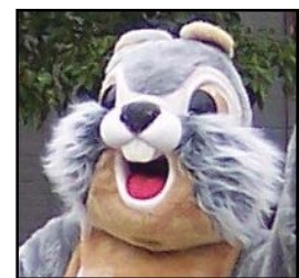
Stewart the Tree Steward Squirrel

The Front Royal/Warren County Tree Steward program has been in